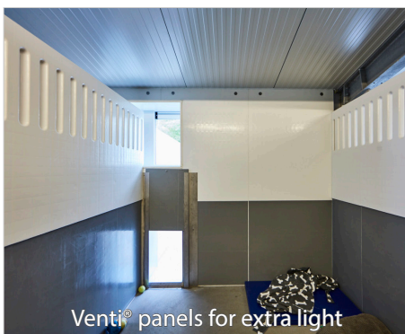
Venti® panels for extra light

Emmely Boeve: "I am very satisfied with my choice to use the materials from Paneltim! The plates are easy to clean, so you can work properly. They do not require maintenance, no annual paintwork is required. Moreover, they are sturdy, colourful and safe. The owners, who come here to have a look before letting their pet stay, are also impressed by the layout, the material and the hygiene. This is very important to me."